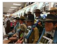
Michael A Pollack Museum in Mesa