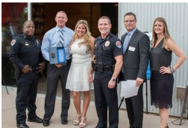
Business co-honoree: the Chandler Police Department