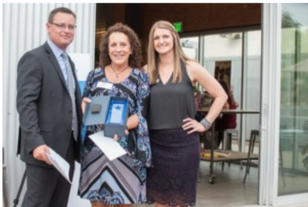
Business co-honoree: Intel