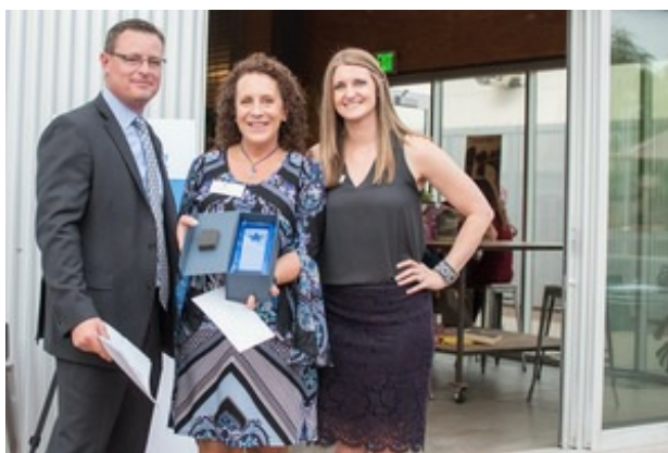
Business co-honoree: Intel