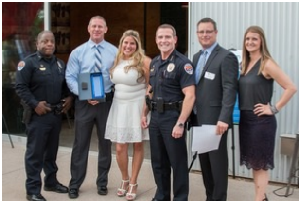
Business co-honoree: the Chandler Police Department